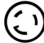
Nema L6-30 Twist

Average water consumption of this machine is 6 gallons per day which represents 192 drinks per day at 4oz per drink